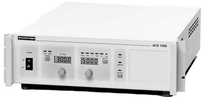
AC Source Module

This highly efficient AC source enables low cost testing at high speed. Selectable input voltage ranges allow this product to be used anywhere in the world to provide a convenient source of variable utility power for the testing and evaluation of domestic and commercial equipment. All common line voltage and frequency combinations are covered.