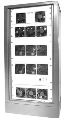
Electronic Load Unit 500

The LOADSAVER product family is a revolutionary, compact and cost effective approach to the test and burn-in of AC and DC sources. LOADSAVER offers a highly versatile combination of multiple programmable load units coupled to an energy recycling system.