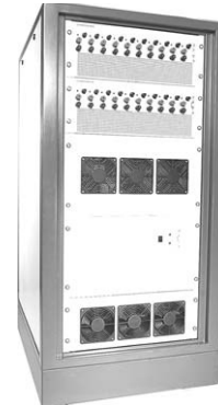
Electronic Load Unit 60

The LOADSAVER product family is a revolutionary, compact and cost effective approach to the test and burn-in of DC sources. LOADSAVER offers a highly versatile combination of multiple programmable load units coupled to an energy recycling system.