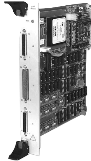
Relay Scanner Module

The Selftest software is structured in a modular fashion to check each of the “sub-systems” in the